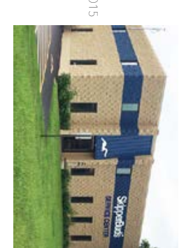
Madison, Wisconsin Skipper Bud's Marina M250 Neptune Series Delivered 2015